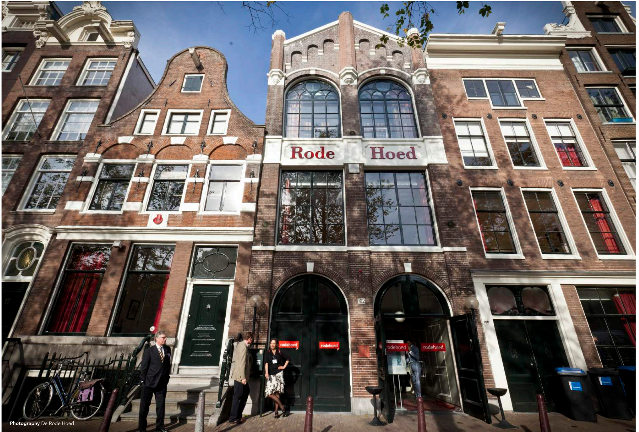
Photography De Rode Hoed