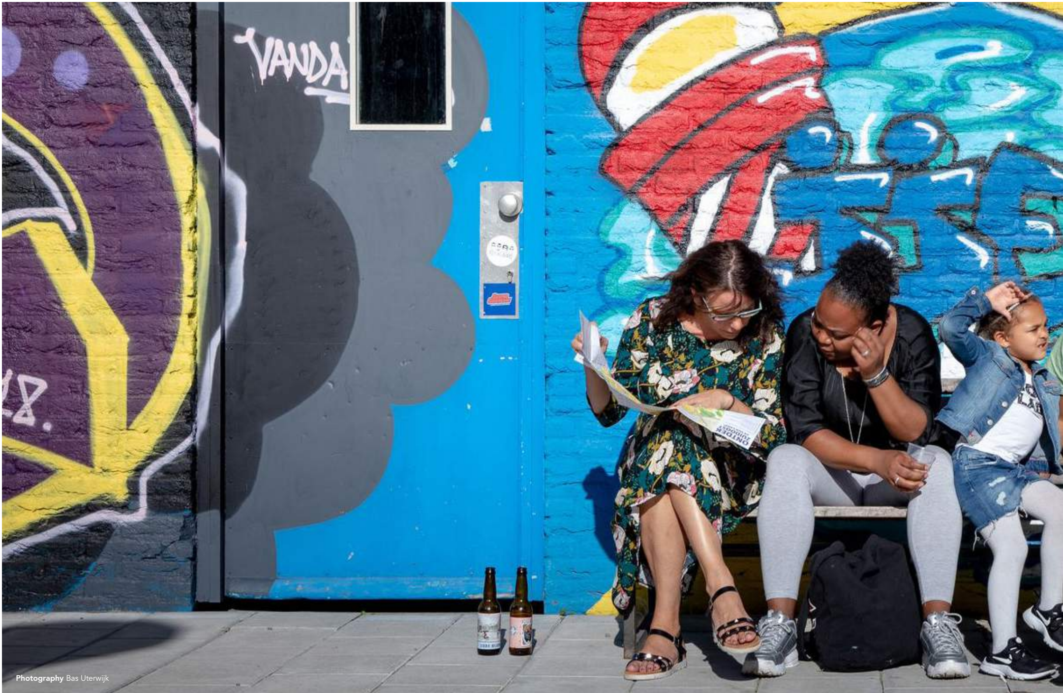
Photography Bas Uterwijk